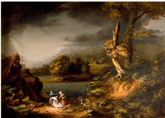
The Tempest , Thomas Cole, American: United States, 19th Century, ca. 1826, Oil on panel, 18 3/4 x 26 inches, Purchase with bequest of Clarissa Hale Poteat 1987.100

You will not want to miss this opportunity—which is exclusive to Art Partners—to explore the Museum with two of its esteemed curatorial voices.