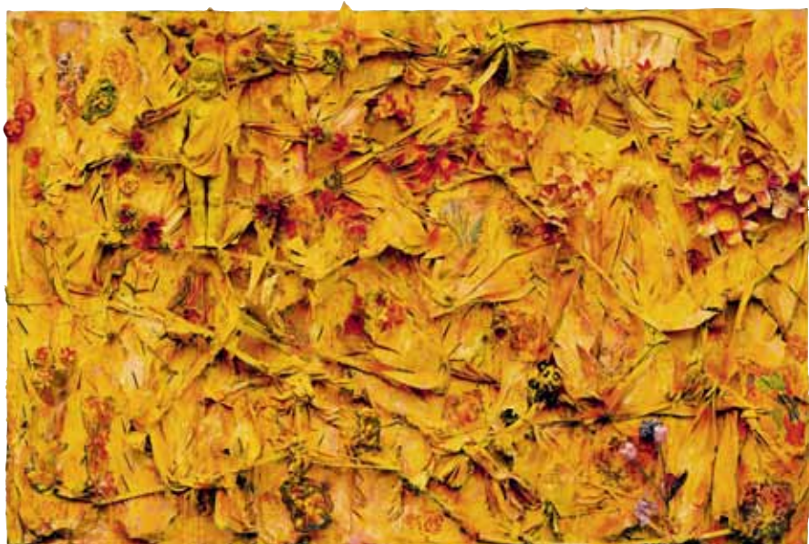
Thornton Dial American, born 1928 The Beginning of Life in the Yellow Jungle , 2003 Plastic soda bottles, doll, clothing, bedding, wire, found metal, rubber glove, turtle shell, artificial flowers, Splash Zone compound, enamel, and spray paint on canvas on wood. 75 x 112 x 13 inches. Collection of Nancy and Tim Grumbacher