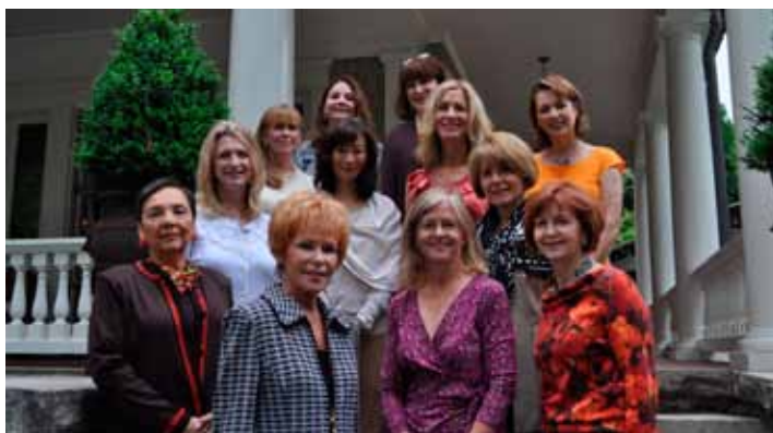
High Arts Day Committee