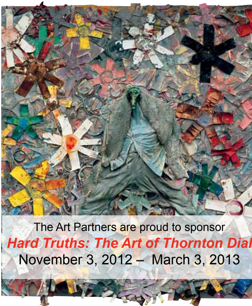
Thornton Dial - Stars of Everything, 2004. Paint cans, plastic cans, spray paint cans, clothing, wood, steel, car-pet, plastic straws, rope, oil, enamel, spray paint, and Splash Zone compound on canvas on wood, 98 x 101.5 x 20.5. Collection of the Souls Grown Deep Foundation.

The Art Partners are proud to sponsor Hard Truths: The Art of Thornton Dial November 3, 2012 – March 3, 2013