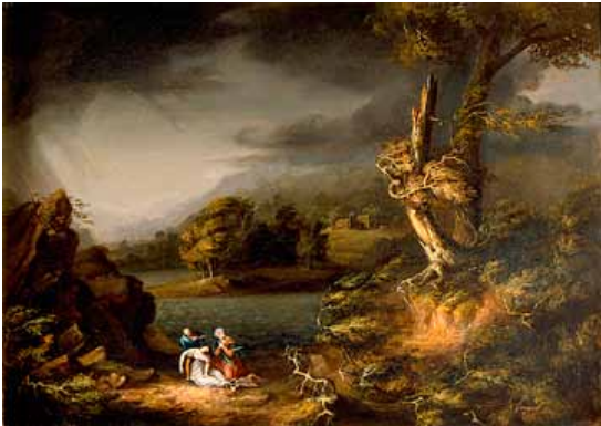
The Tempest , Thomas Cole, American: United States, 19th Century, ca. 1826, Oil on panel, 18 3/4 x 26 inches, Purchase with bequest of Clarissa Hale Poteat 1987.100

You will not want to miss this opportunity—which is exclusive to Art Partners—to explore the Museum with two of its esteemed curatorial voices.