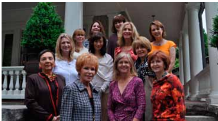
High Arts Day Committee